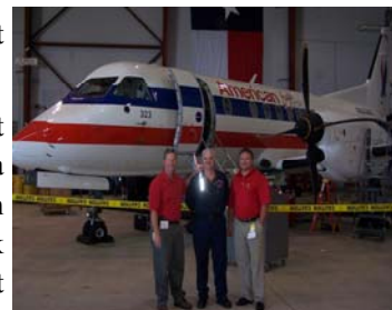
Above: Recently, NAA visited American Eagle forging a strong long-term relationship for future NAA Graduates.