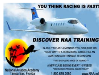
Above: Catch this ad in the 2006 edition of Race for the Cup .

The next NAA Open House will be on October 14th from 9:00am to 3:00pm. There will be refreshments and tours of both the school and hangar, Financial Aid and Placement Seminars, and interactive demonstrations.