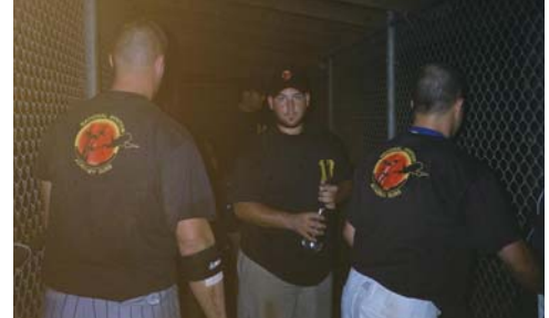
Above: NAA's inaugural softball season kicked off on September 12th.

will help build student camaraderie and friendship, as well as allowing students to let loose and have some fun.