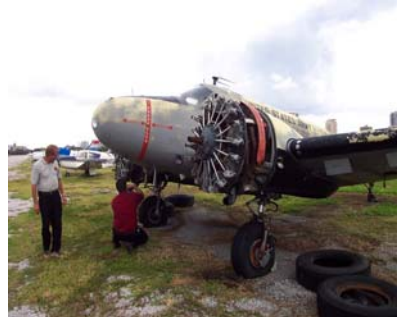
Above: NAA Students working on Landing Gear of C-45H Beechcraft.

The Beechcraft was a military transport/cargo plane in service throughout the 50's and 60's.