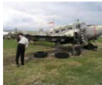
Above: Beechcraft C-45H at the hangar being prepared for refurbishing.